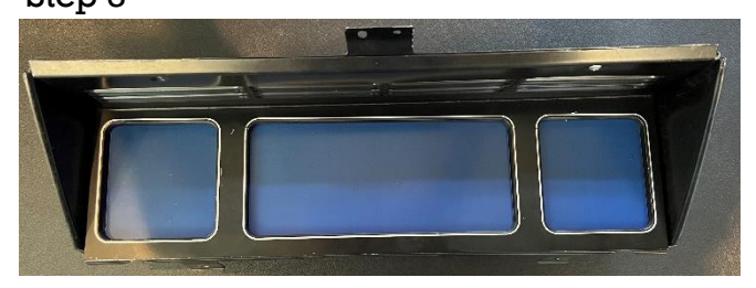
Reinstall the factory bezel using the original mounting hardware.