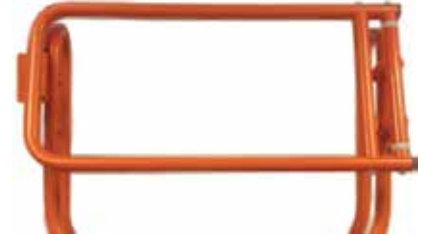
Shown installed on Safe-T™ Ladder (#10800)